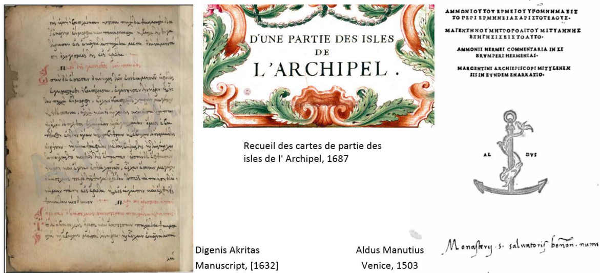
Figure 1: Highlights from the AUTH Library collections